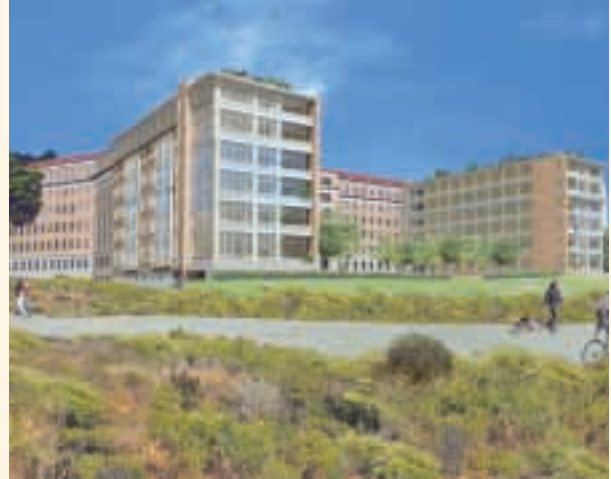
Each alternative for the PSHH site would achieve rehabilitation of the historic hospital.

Historic Preservation – All alternatives