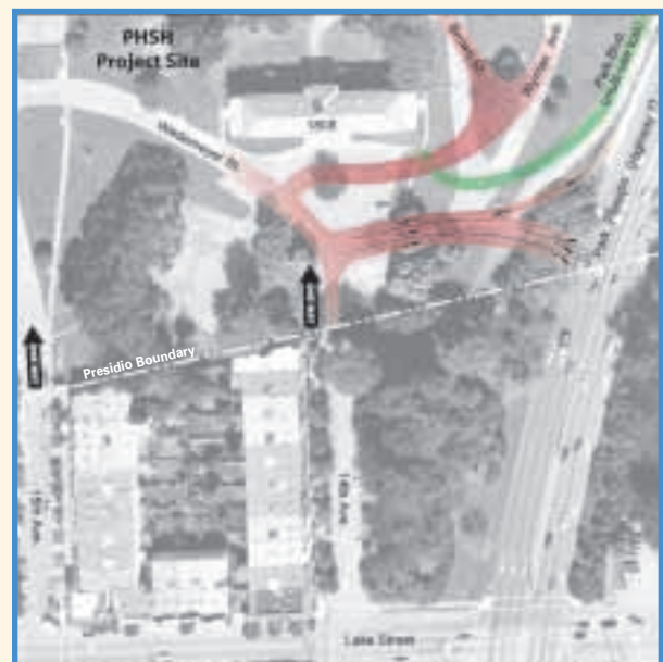
Park Presidio access option.

In the future, the Trust expects to propose a scenic overlook and trailhead, which would include visitor amenities, near the southwest corner of the PHSH site.