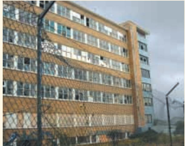
The Public Health Service Hospital has been subject to vandalism and deterioration.