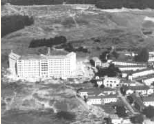
The old hospital complex from 1875, at right, with the new hospital under construction at left. The photo is circa 1931.

hospital building, which is historic, be rehabilitated and converted to residential use. Other buildings within the complex were also made available.